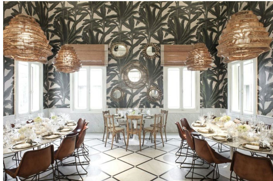
BANANA ROOM (29 PERS)