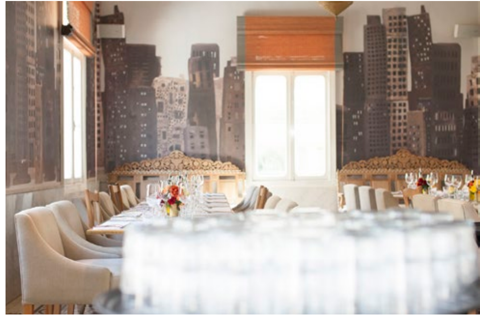
BUILDING ROOM (50 PERS)