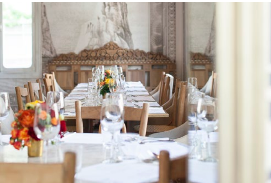
MONEY ROOM (50 PERS.)