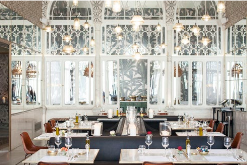
MAIN ROOM (60 PERS.)